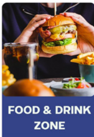
FOOD & DRINK ZONE